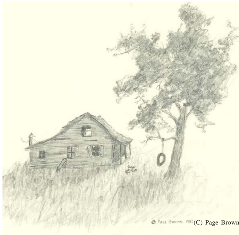
© PAGE BROWN 1982 (C) Page Brown 1982