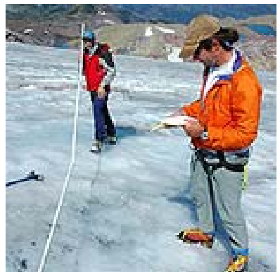
Scientists taking measurements of Sperry Glacier in Glacier National Park.