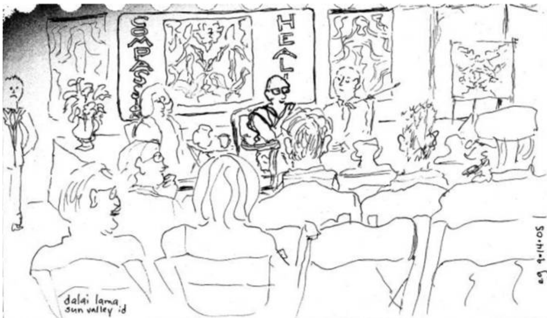
Dalai Lama in Sun Valley

We believe that the most important thing about a person's faith is whether or not it makes the believer a better person and the world a better place. God is a mystery beyond anybody's ability to understand fully, so each person in our churches pursues her or his own spiritual path, within a loving, respectful community. We know that all religions, including ours, are inventions of human beings, so we try very hard to pay attention to two things: the sacred, which rises above all belief systems; and human need, within our communities and in the larger world.