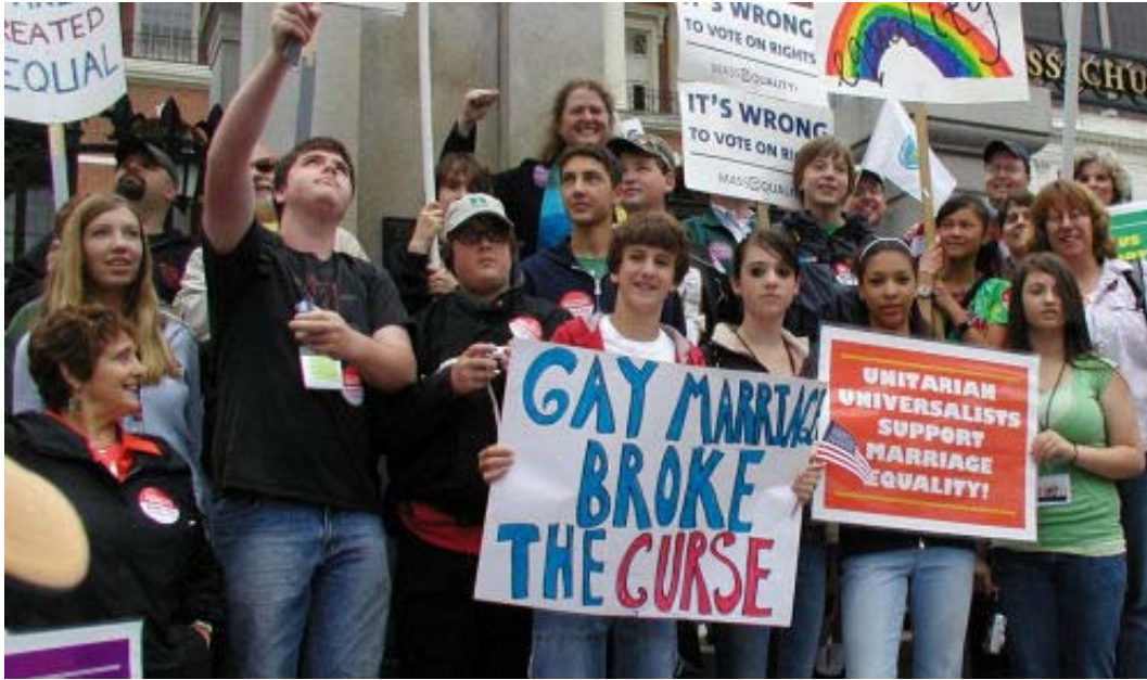
2007 Boston Bounders at the Massachusetts Statehouse